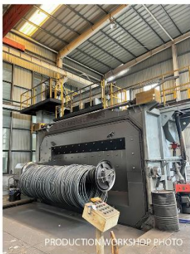
PRODUCTION WORKSHOP PHOTO