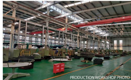
PRODUCTION WORKSHOP PHOTO