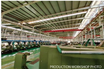
PRODUCTION WORKSHOP PHOTO