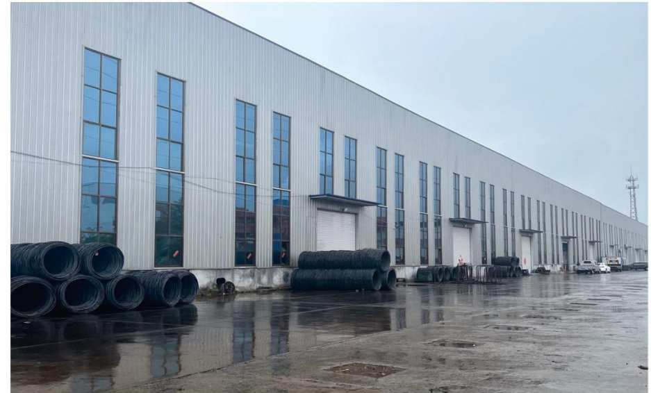
▲ FACTORY PHOTO